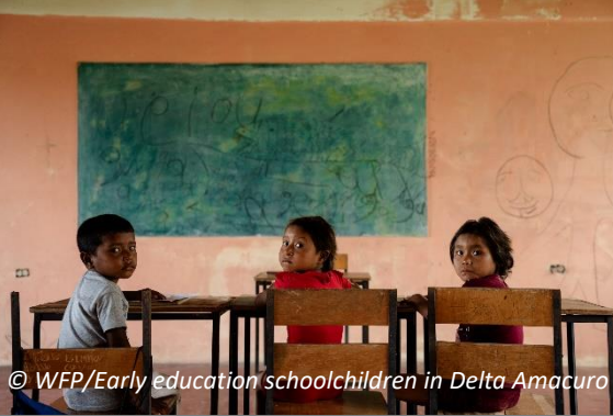
Early education schoolchildren in Delta Amacuro