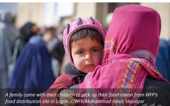
A family came with their children to pick up their food ration from WFP's food distribution site in Logar.