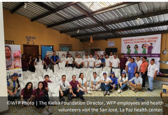
The Kielsa Foundation Director, WFP employees and health volunteers visit the San José, La Paz health center.