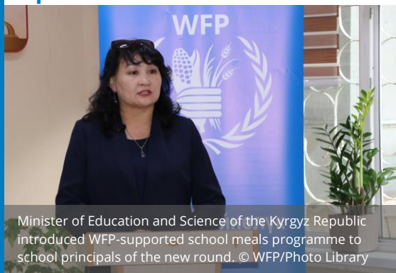
Minister of Education and Science of the Kyrgyz Republic introduced WFP-supported school meals programme to school principals of the new round.