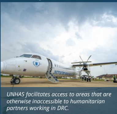
UNHAS facilitates access to areas that are otherwise inaccessible to humanitarian partners working in DRC.