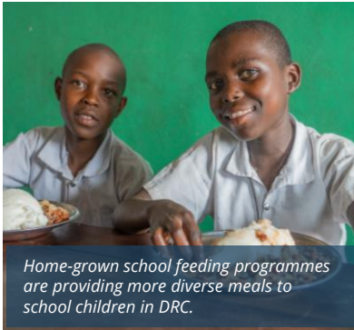
Home-grown school feeding programmes are providing more diverse meals to school children in DRC.