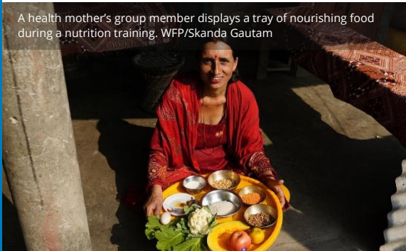
A health mother's group member displays a tray of nourishing food during a nutrition training.