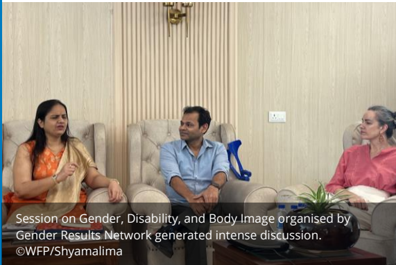
Session on Gender, Disability, and Body Image organised by Gender Results Network generated intense discussion.