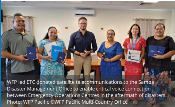
WFP led ETC donated satellite telecommunications to the Samoa Disaster Management Office to enable critical voice connection between Emergency Operations Centres in the aftermath of disasters.