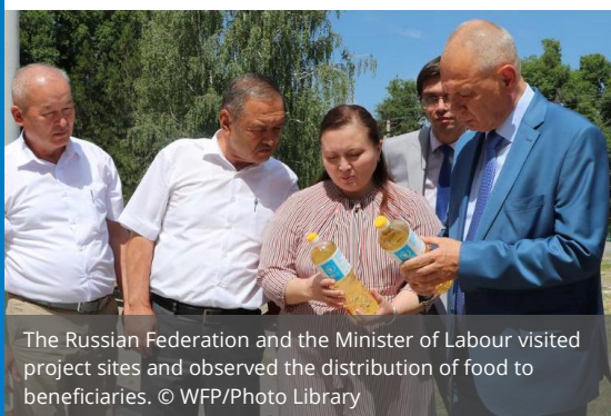
The Russian Federation and the Minister of Labour visited project sites and observed the distribution of food to beneficiaries.