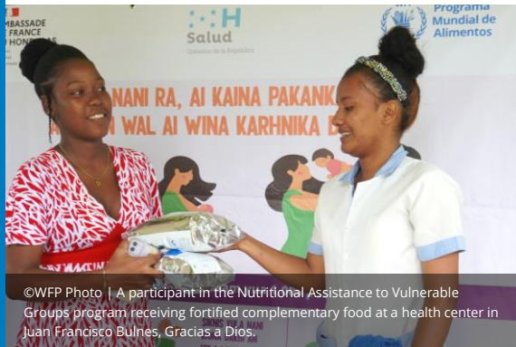
A participant in the Nutritional Assistance to Vulnerable Groups program receiving fortified complementary food at a health center in Juan Francisco Bulnes, Gracias a Dios.