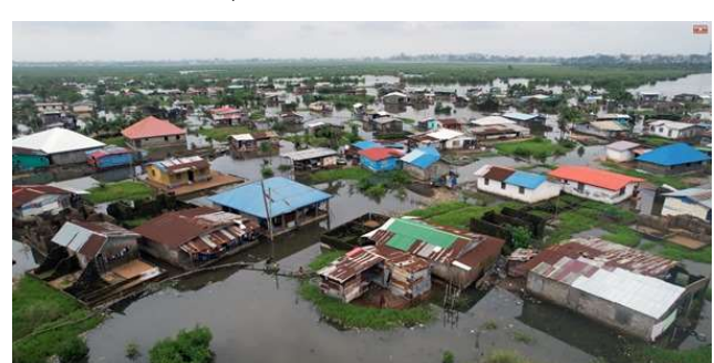
Photo Caption: A vulnerable with her baby's house sounded by water.

WFP developed a floods response concept note with funding requirements of US$ 3.7 million to provide 3 months emergency food assistance to 12,000 most affected and food insecure families.