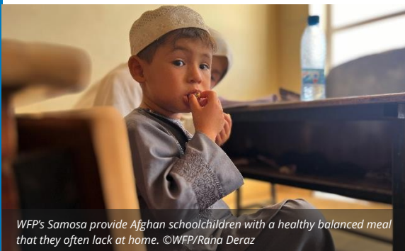
WFP's Samosa provide Afghan schoolchildren with a healthy balanced meal that they often lack at home.