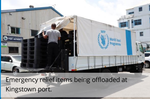
Emergency relief items being offloaded at Kingstown port.