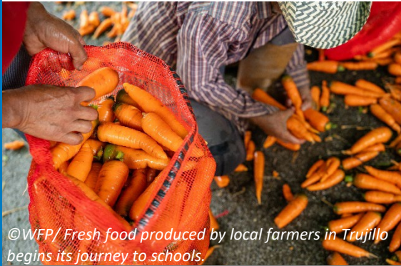
Fresh food produced by local farmers in Trujillo begins its journey to schools.