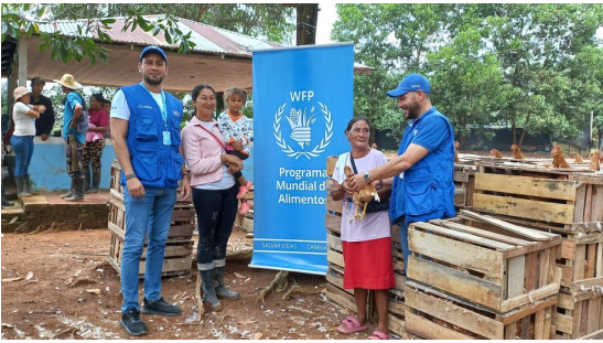
Families receiving chickens as part of a peace and social cohesion project in Tibú, Norte de Santander