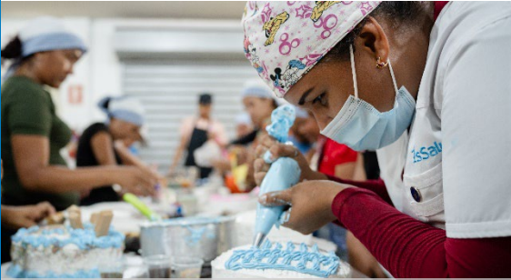
A woman prepares a cake at the bakery course provided by WFP as part of its livelihoods interventions.