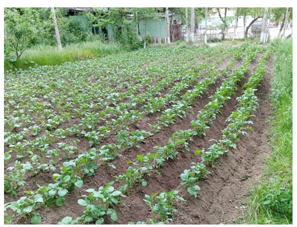
WFP encourages schools to grow vegetables in their pre-school land plots to diversify school meals.

In January, WFP Tajikistan dispatched about 2,000 mt of food commodities to Afghanistan. The UN Humanitarian Air Service, managed by WFP, undertook eight international passenger flights between Dushanbe and various airports in Afghanistan. Sixtyfive passengers benefited from these flights and 175 kg of cargo was delivered.