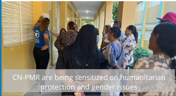
CN-PMR are being sensitized on humanitarian protection and gender issues