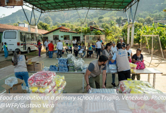
Food distribution in a primary school in Trujillo, Venezuela.