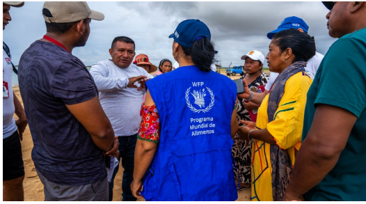
WFP Colombia personnel with the National Government loading and delivering food in areas affected by the floods in La Guajira.