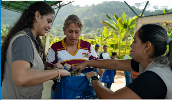
Food distribution at a primary school in Trujillo, Venezuela.