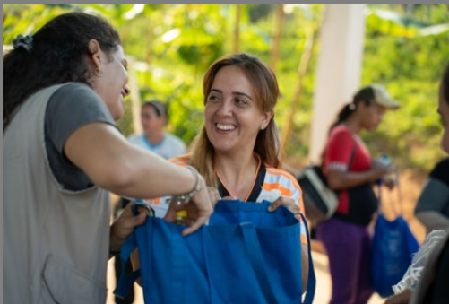
WFP's Implementing Partner Staff and a woman share a moment of joy during a school meals programme food distribution.

WFP Venezuela has been included in the list of operations with a “partial stop work order” issued by the U.S. government, affecting the food security and logistics clusters. Though WFP awaits further details on the implications for the different portfolios in the country, is carrying out significant operational adjustments and cost-containment measures to ensure continuity as much as the available resources allow so.