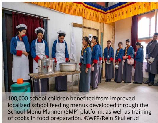
100,000 school children benefited from improved localized school feeding menus developed through the School Menu Planner (SMP) platform, as well as training of cooks in food preparation.

35 government officers trained in emergency logistics capacity assessment