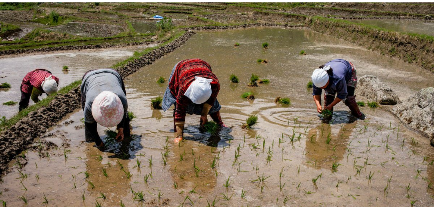
Farmers planting rice in their rice paddy fields. Rice is a staple for Bhutanese people. The challenges faced by smallholder farmers are the changing weather and erratic (rainfall) patterns.

agriculture value chain actors supported by WFP