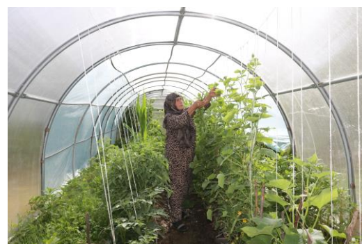
WFP trained Tajik women to grow vegetables in greenhouses.