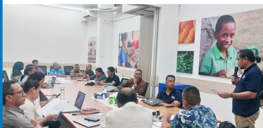
Government partners participated in the national orientation session for the School Kitchen Food Safety Certification Programme organized by WFP.