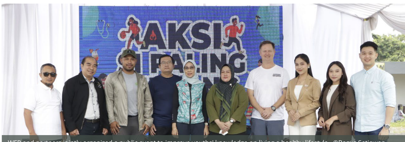
WFP and partners jointly organized a public event to improve youths' knowledge on living a healthy lifestyle.