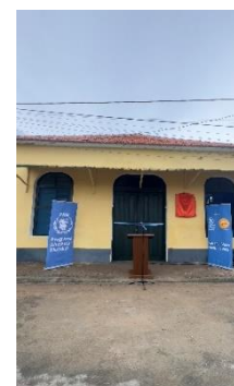
Figure 1 Rehabilitated PNASE warehouse