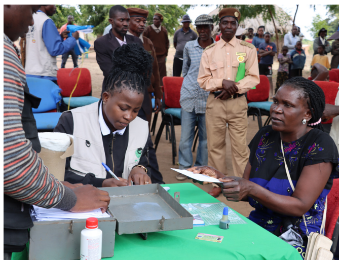
Insurance payouts in Tete province Mozambique

As WFP's programmes mature, sustainability and local ownership are paramount. WFP is working toward integrating its programmes into national systems to ensure long-term sustainability. This involves integrating financial services within government programmes, such as social protection schemes or agricultural input initiatives. Additionally, WFP keeps supporting the strengthening of local markets by addressing both demand and supply-side challenges. This is done by identifying and overcoming barriers that prevent vulnerable populations from accessing and benefiting from financial services, such as through temporary premium subsidies and investments in financial literacy. On the supply side, WFP focuses its efforts on building the capacity of local