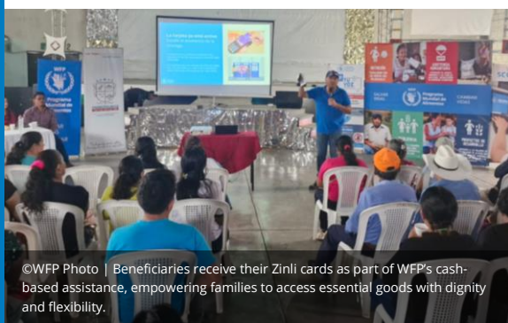
Beneficiaries receive their Zinli cards as part of WFP's cash-based assistance, empowering families to access essential goods with dignity and flexibility.