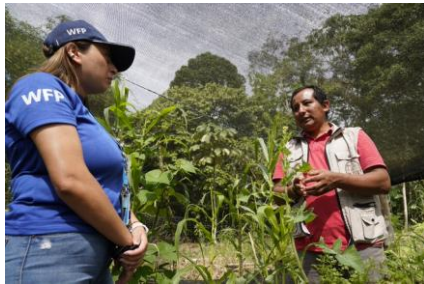
WFP staff together with a participant from the Ishu Awá Indigenous Reserve community in one of the nurseries implemented as part of the framework of the Binational Adaptation Project in Putumayo.