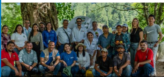
The Ambassador of France visits western Honduras to witness the impact of WFP's Fresh Ration Project, boosting children's nutrition and supporting local communities