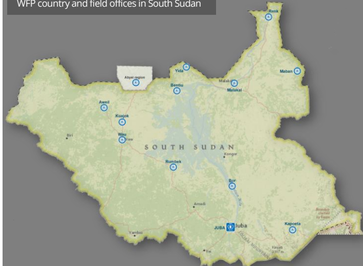
WFP country and field offices in South Sudan

WFP is implementing a three-year Country Strategic Plan (CSP, 2023-2025), building on its life-saving support to create pathways for resilience, development and peace. WFP seeks to reduce entrenched inequity and isolation by fostering unified, interconnected, and peaceful communities. WFP continues to support zero hunger objectives while contributing to peace and climate resilience. See the CSP funding statistics on page 2.