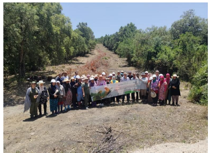
Beneficiaries, WFP Tunisia, Women's Association for Citizenship and Development (in French AFPCD) and DG Forests staff at Ain Baccouche Nature Reserve's firebreak area. Tabarka governorate – 2025

This activity strengthened the capacity of local institutions, including the Directorate General of Forests and the Ministry of Agriculture, and is expected to foster better governance of Tunisia's forest heritage, ultimately improving the livelihoods of the 10 percent of Tunisians living in and around forests, especially the most vulnerable.