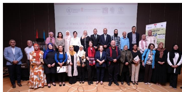
A group photo during the launch event of the National Food Security Platform held in collaboration with the Ministry of Agriculture and key partners – Tunis – 2025

In October 2025, WFP supported the Government of Tunisia in launching the nation's first national food security platform, foodsecurity.tn . Led by the Ministry of Agriculture in partnership with WFP, the National Observatory of Agriculture (ONAGRI), and the Bizerte Competitiveness Pole (PCB), this innovative platform offers reliable, data-driven insights to support evidence-based decision-making—a milestone that strengthens collaboration among national institutions and partners. The launch featured a joint event with the Ministry of Agriculture to present the platform on a national scale.