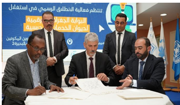
From left, WFP Tunisia Country Director, the General Director of the School Works Office at the Ministry of Education, and Esri North Africa Technical Manager sign the project closure statement. Standing from left are OOSCO's representative and WFP ICT officer, during the official event – Tunis – 2025