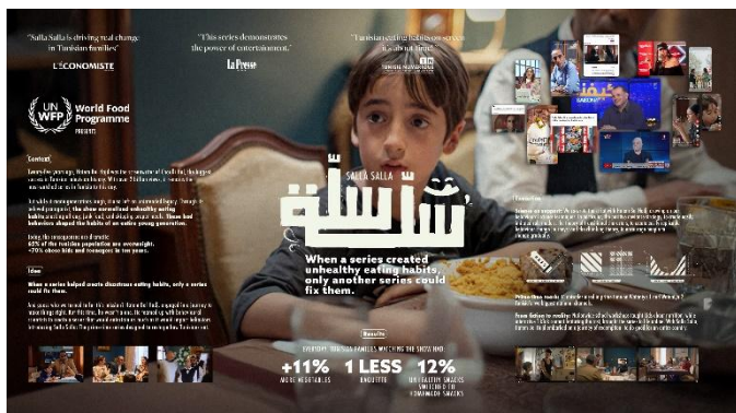
The SBCC Salla Salla TV Series board – 2025

** ADAPT in French : 'Appui au Développement durable dans le secteur de l'Agriculture et de la Pêche artisanale en Tunisie.' ADAPT focuses on connecting supply chains, encouraging sustainable production, and linking consumption areas to production territories. For more information about the project. Read more on ADAPT here .