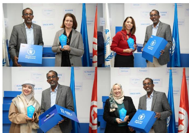
WFP’s Country Director with VP CP Balades Solidaires, representative from AICS, a representative from ARCS NGO and a representative from UTAP NGO– Tunisia, 2025

Over the years, WFP Tunisia collaborated with 38 partners under the CSP, including donors, government departments, NGOs and other civil society organisations. In recognition of their critical contributions, on 9 December, WFP country team held a THANK YOU ceremony to appreciate their partnership and mark the closure of its Country Strategic Plan (2022–2025) and WFP’s exit.