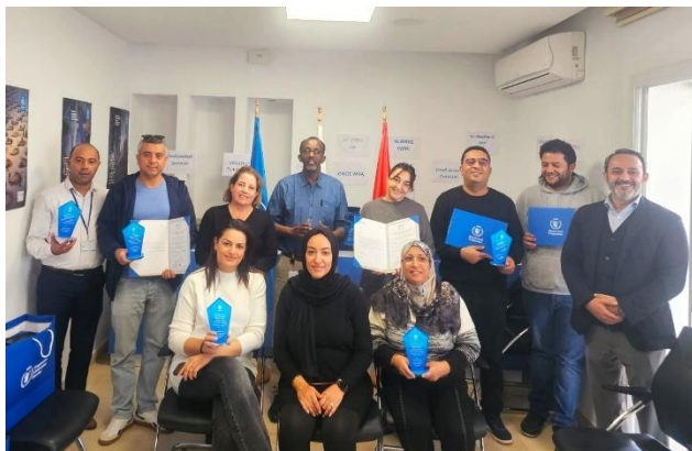
WFP Tunisia staff receive trophies and certificates at an appreciation event in Tunis, 2025

Each staff member received certificates and appreciation letters from WFP Executive Director, Country Director a.i., and Regional Director, recognizing their years of service and dedication, particularly during the challenging transition year of 2025.