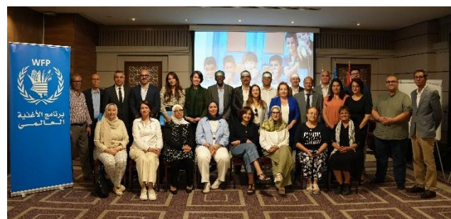
WFP staff and partners gathered during the event to share results from the evaluation of support for smallholder farmers and the National School Meals Programme, highlighting key findings, sustainability, and pathways for national integration – Tunis, 2025

Overall, similar operations in other regions could benefit from increased focus on vulnerability, value chains, and more local-level participatory design. The full evaluation report is available at WFP.org .