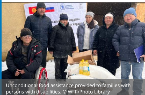
Unconditional food assistance provided to families with persons with disabilities.