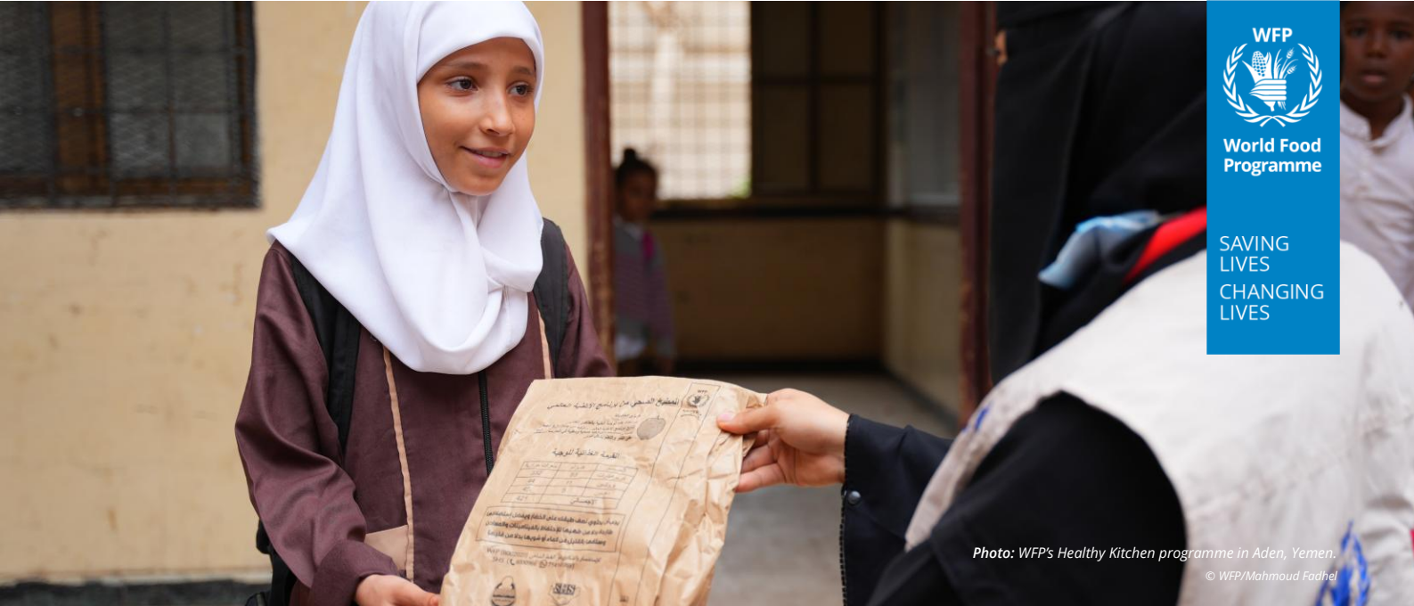
Photo: WFP's Healthy Kitchen programme in Aden, Yemen.