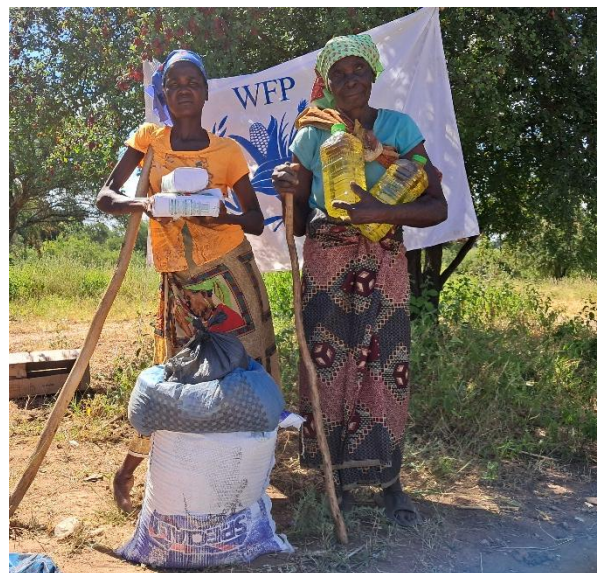
Beneficiaries receiving return kits in Gaza Province.

Australia, Austria, Brazil, Canada, the European Commission, Finland, France, Germany, Green Climate Fund, Ireland, Italy, Japan, Latvia, Liechtenstein, Luxembourg, Mozambique, Netherlands, Norway, Portugal, Private Donors, the Republic of South Korea, the Russian Federation, Saudi Arabia, Slovenia, Spain, Sweden, Switzerland, UN CERF, UN funds other than CERF, the United Kingdom, the United States of America (in alphabetical order).