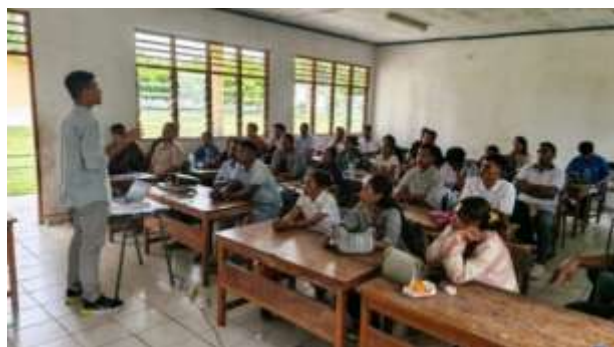
Enumerator training, Covalima municipality.