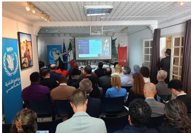
Photo caption & credit: WFP and partners convene a high-level advocacy event to address food security and nutrition challenges in the refugee camps near Tindouf.