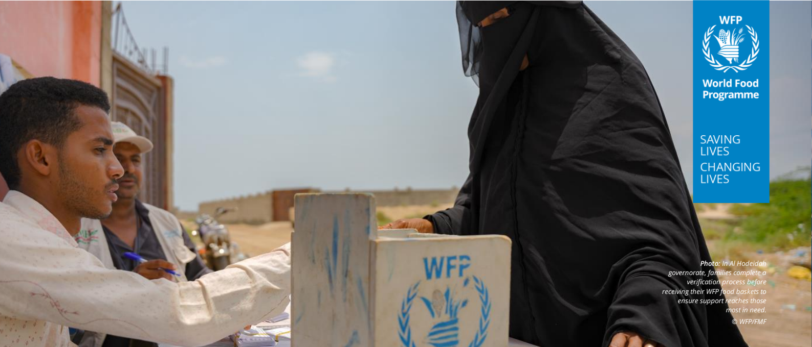
Photo: In Al Hodeidah governorate, families complete a verification process before receiving their WFP food baskets to ensure support reaches those most in need.