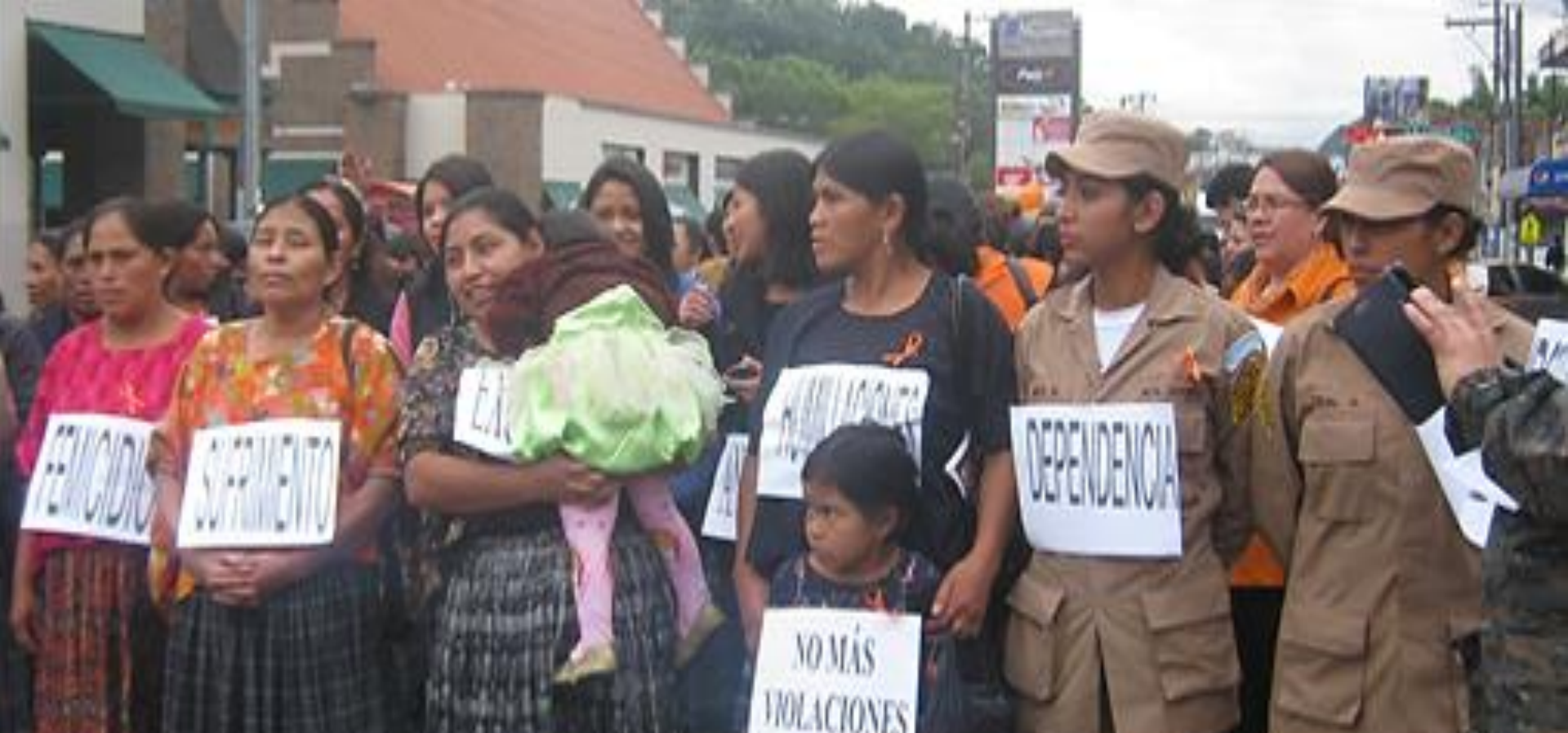
Marching to demand gender justice and a decrease in violence in Guatemala