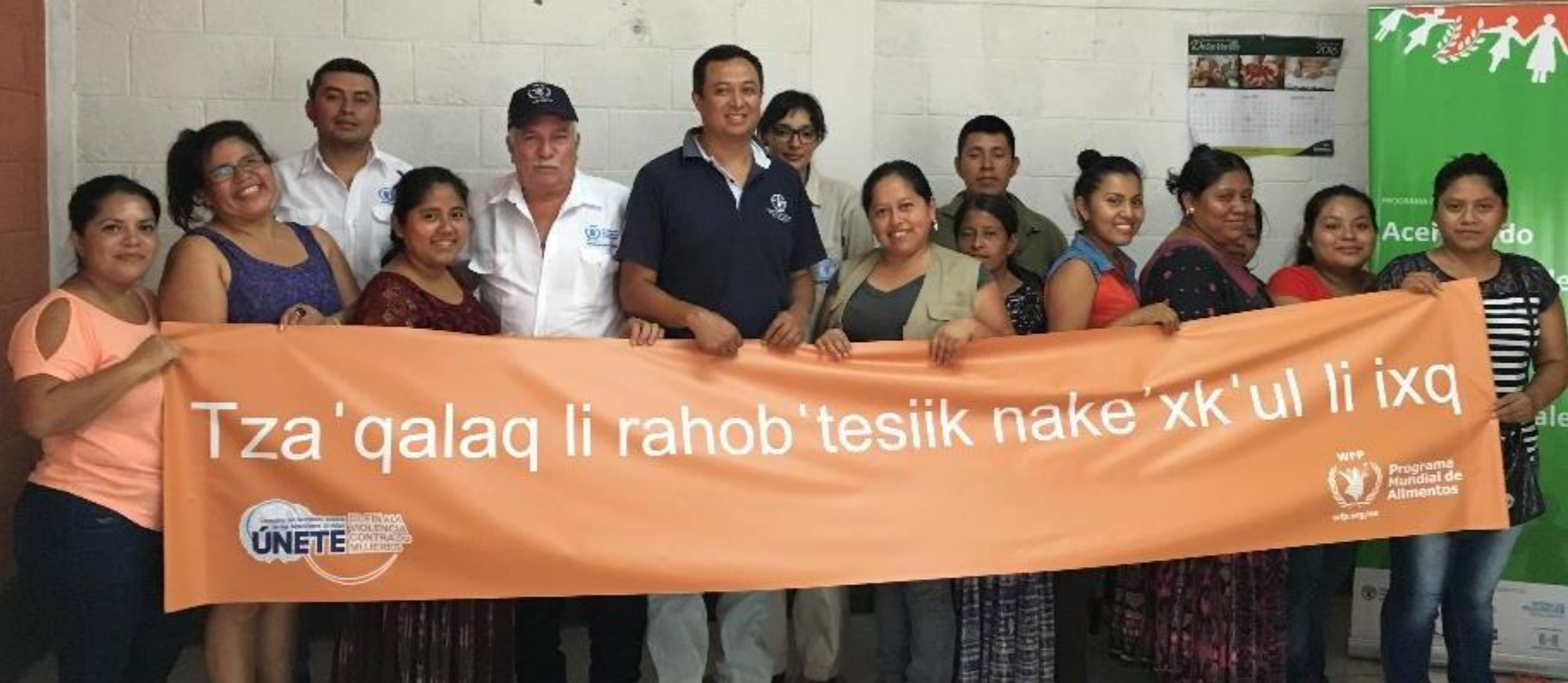
Working with local communities to raise awareness on GBV in Guatemala