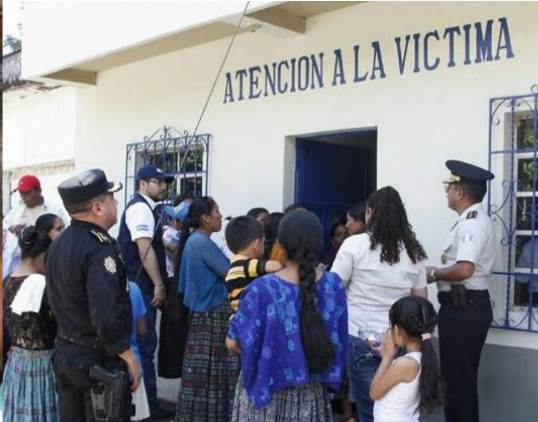
Opening of the first survivors' support bureau in Santa Catalina La Tinta, Guatemala