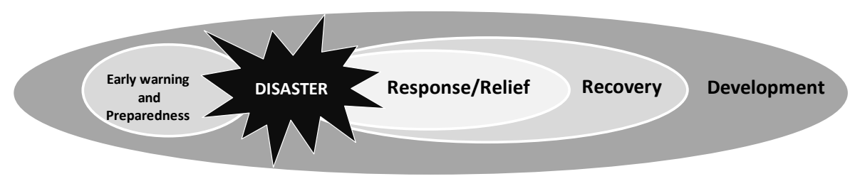
Figure 1: Disaster Risk Reduction and Management Diagram

DRR ACTION TAKES PLACE DURING ALL PHASES OF THE DEVELOPMENT, RELIEF AND RECOVERY CYCLE