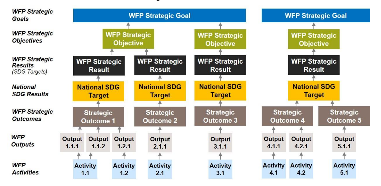
Figure 3: WFP results chain

27. The WFP results chain (Figure 3) is the core of WFP's results-oriented management approach at the country level.