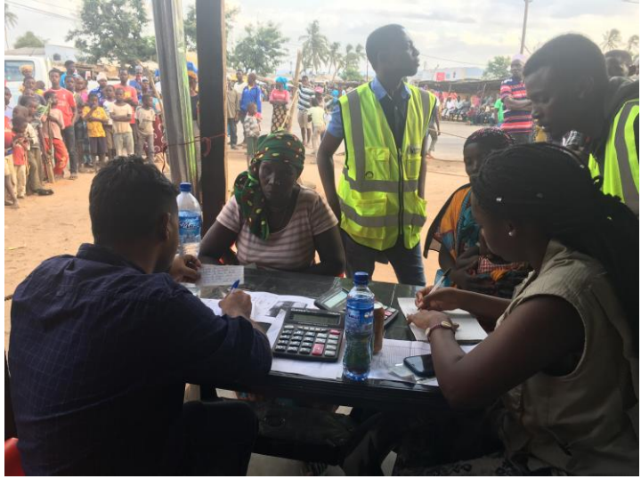
CBT Voucher Distributions, Macomia (Cabo Delgado)