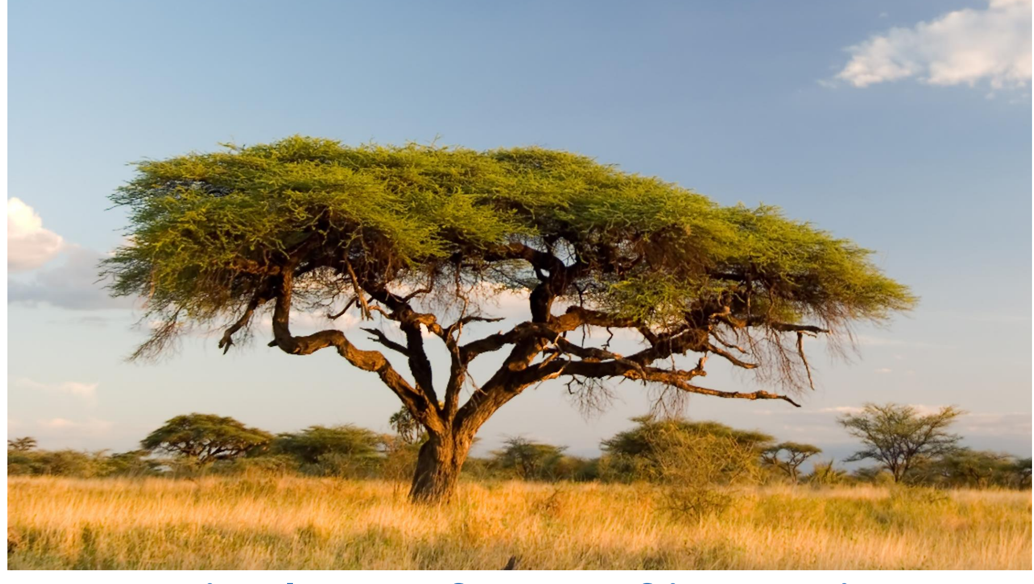
Regional Bureau for West Africa Overview 20 November 2019