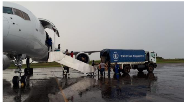
WFP HEB cargo arrival in Chimoio