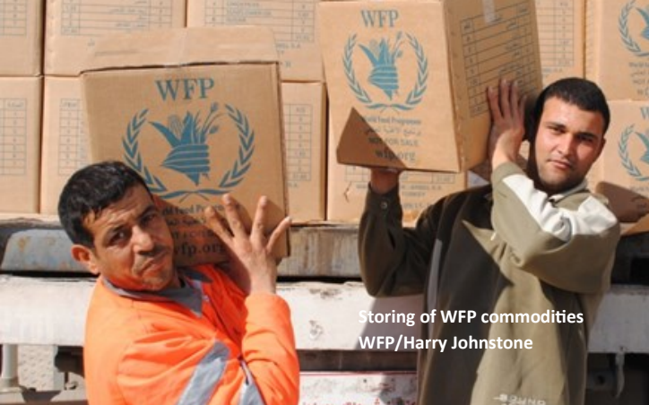
Storing of WFP commodities