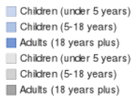
Country Beneficiaries by Gender and Age